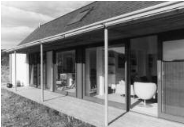
FIGURE 10. Dualchas Building Design, Druim Bà, Camuscross, Isle of Skye, Inner Hebrides, 2004.

In contrast, Druim Bà, Camuscross, Sleat, Isle of Skye, Inner Hebrides, 2004, is a single-story, timber-frame box rendered white with a slated gabled roof enclosing a centrally planned open living space. The whole is entirely glazed to the south-facing side with full-height panel doors opening onto a steel and oak verandah ( FIG.10 ). The design of the house takes advantage of the formal similarities between eighteenth-century everyday Classicism and Modernism to produce a synthesis of the Highland improved cottage and a twentieth-century design aesthetic. In their most recent work DBD have developed low-cost timber-framed, timber-clad kit-houses for low-income rural areas such as the crofting communities. DBD acknowledge the complexity of Highland history and its social contexts and continue to explore these themes in their work.