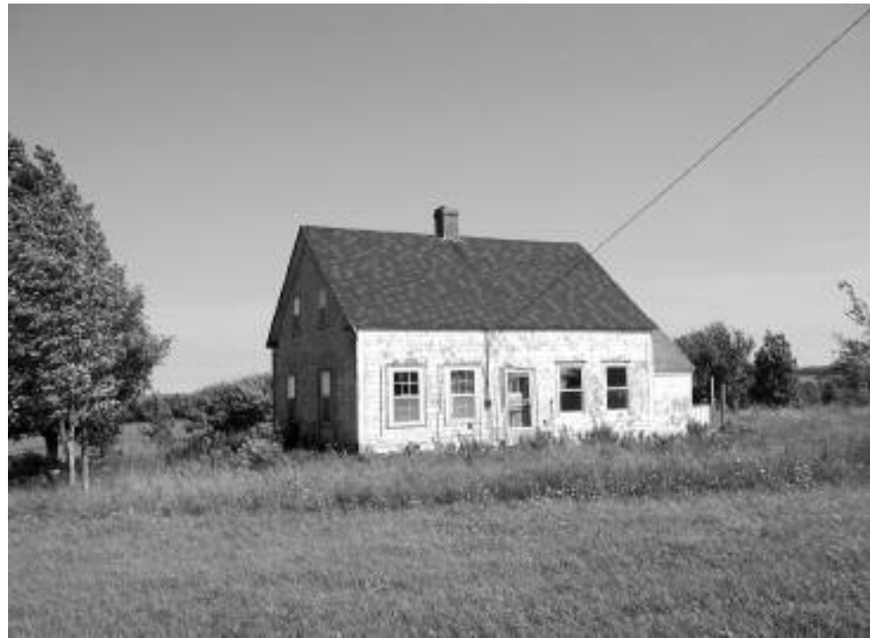
FIGURE 5. Classical ornamentation to early-nineteenth-century Highland settler's house in Canada. MacGillivray House, Upper South River, Antigonish County, Nova Scotia, Canada.

guage, literature, music and dance — a valued intangible heritage. Yet, while Scottish emigrants' songs and poetry make repeated reference to their sense of loss for their former communities and lands, there are no nostalgic references to the blackhouse. A contemporary house expressed a modern and improving attitude within a culturally vibrant Gaelic colonial society. New architecture was of great cultural significance and readily embraced as a social indicator of the emigrant Scottish Gaelic community's new wealth, status and modernity as colonial farmers and landowners. The sole blackhouse in Canada is the Lone Sheiling, Cape Breton, Nova Scotia. It is a scale replica, a monument built by the descendants of Highland settlers in 1947. As Marjory Harper and Michael Vance have observed, "the thought of assembling the necessary stones in order to construct a remembrance of home could only have occurred to later generations with sufficient resources and leisure to indulge such sentimental inclinations." 19