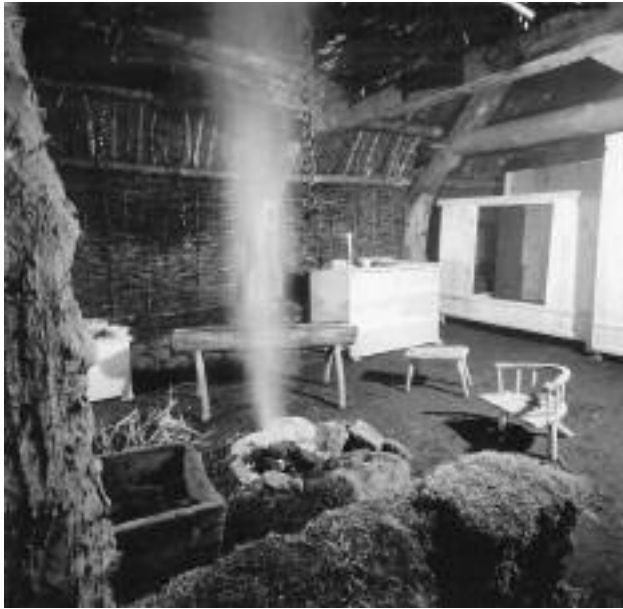
FIGURE 2. Interior of reconstructed blackhouse, Highland Folk Museum.

The blackhouse was a traditional building type common to most ranks of Scottish Gaelic society. The term “traditional” is generally taken to indicate that the form, structure and materials of the blackhouse were a response to the specifics of a place, Highland Scotland, and a people, Scottish Gaels, over time (a shifting dynamic between environment, function and cultural practices). 7 This understanding of “tradition” leads to notions of place and ethnicity (or more broadly national, regional and subregional identities) within settled communities (often but not always rural and peasant in origin). It involves a post-romantic study of folk architecture. In this regard, Alan Colquhoun has written that the study of folk culture “represents an attempt to preserve a regional essence that is seen to be in mortal danger and [its aim is] to uphold the qualities of Kultur against the incursions of a universalizing and rationalizing Zivilization.” 8