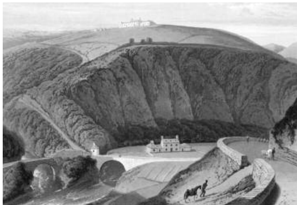
FIGURE 3. William Daniell, “Berrydale, Caithness,” from A Voyage Round the Coast of Scotland and the Adjacent Islands , 1814–1822.

Highland tenant farmhouses are relatively large, two-story buildings with a three-cell rectangular plan typical of late-eighteenth-century British everyday Classicism. Many of these improvement-era farmhouses were depicted in William Daniell’s contemporary travelogue, A Voyage Round the Coast of Scotland (FIG. 3). 14 A sample of more than a thousand photographs of farmhouse front elevations was taken from across Scotland and analyzed by Robert Naismith for the Countryside Commission of Scotland in 1985. 15 Naismith’s analysis of the relationship between each building’s overall facade and the location and size of its doors and windows