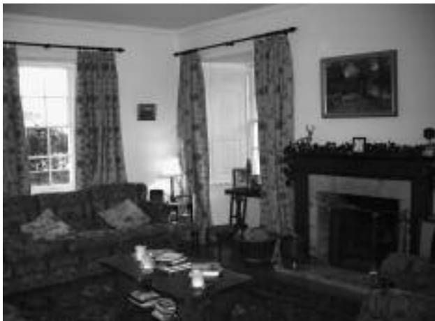
FIGURE 4. The parlor, Glassingall Farm House, Perthshire.

The well-ordered, symmetrical, three-bay facade visually maintained a household's standing within the community. It was a statement of modernity and wealth, social aspiration and conformity. Nicholas Cooper described much the same phenomenon in a parallel English context: "in building uniform houses . . . which conformed to architectural norms . . . members of eighteenth-century [society] expressed their standing and their sense of community." 6