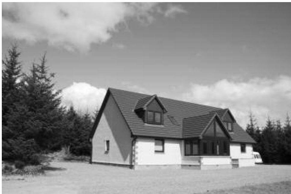
FIGURE 8. Newly built housing following design guide regulations. West Drummond View, Whitebridge, Inverness-shire, Central Highlands.

The lifeworld is that background of beliefs, values, and practices that provides a horizon of meaning for our