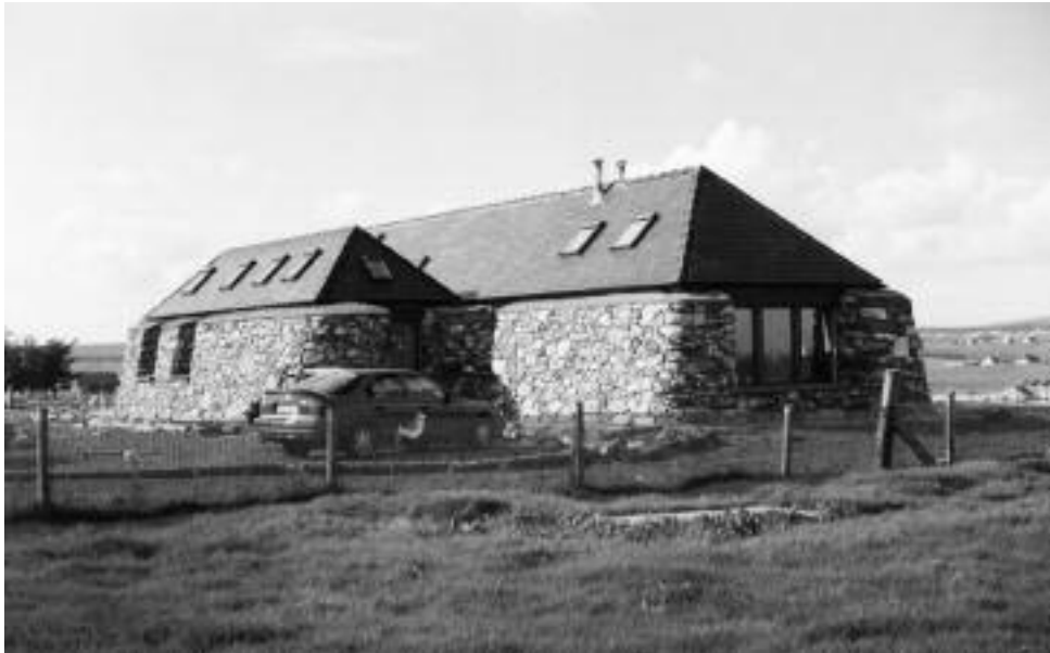
FIGURE 9. Dualchas Building Design, Barden House, Coll, Isle of Lewis, Outer Hebrides, 1998.

In contrast, Druim Bà, Camuscross, Sleat, Isle of Skye, Inner Hebrides, 2004, is a single-story, timber-frame box rendered white with a slated gabled roof enclosing a centrally planned open living space. The whole is entirely glazed to the south-facing side with full-height panel doors opening onto a steel and oak verandah ( FIG.10 ). The design of the house takes advantage of the formal similarities between eighteenth-century everyday Classicism and Modernism to produce a synthesis of the Highland improved cottage and a twentieth-century design aesthetic. In their most recent work DBD have developed low-cost timber-framed, timber-clad kit-houses for low-income rural areas such as the crofting communities. DBD acknowledge the complexity of Highland history and its social contexts and continue to explore these themes in their work.