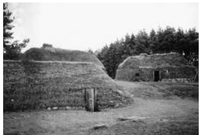
FIGURE 1. Baile Geane, reconstruction of an early eighteenth-century Highland settlement, clachan or bailtean, Highland Folk Museum, Kingussie, Central Highlands.

Inside, the long, low, rectangular form of the blackhouse provided a single living space. This was heated by a peat fire in a simple stone hearth in the center of the floor, with the heavy peat smoke escaping slowly through the thatch (FIG. 2). Functional determinism does not fully explain the form and function of the blackhouse, however. The central hearth was the social heart of Gaelic culture. The Highland ceilidh , or gathering, originated in communal storytelling, singing, and music sessions held around the glow of the central hearth through the long, house-bound winter months. Scottish Gaelic culture is principally based upon this intangible heritage, and the central hearth and enclosed space of the blackhouse framed and informed the centripetal social ritual of the ceilidh . 6